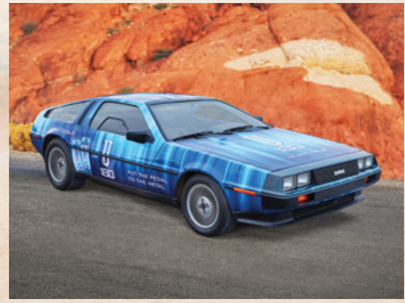
A film as unique as the vehicles it's designed for.