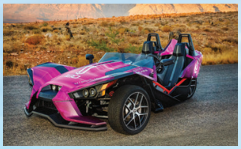
▲ Push your removals into hyperdrive.