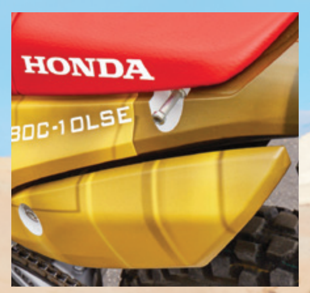
▲ Go to extremes with rugged wraps that hold up to the toughest rides.